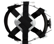
HPR461 – 6-point Ratchet Replacement Suspension